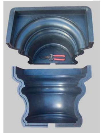
Column crown /base